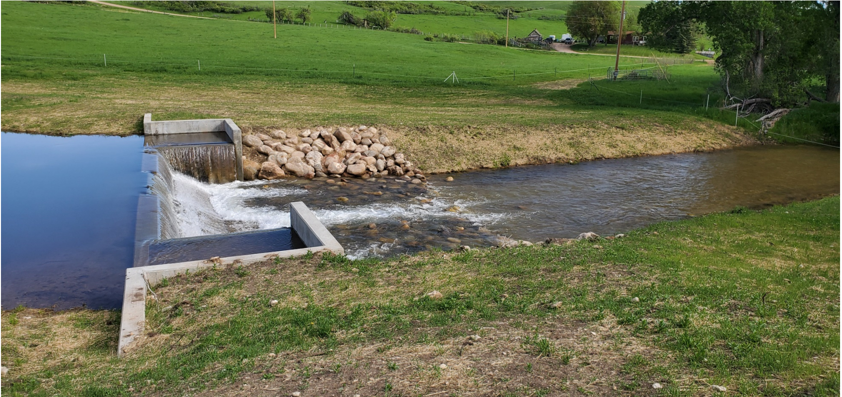
West Pass Creek fish barrier structure completed in 2020.