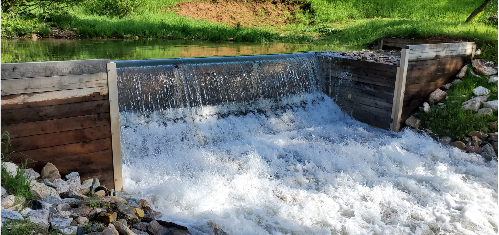
North Fork of West Pass Creek timber crib barrier structure completed in 2018.