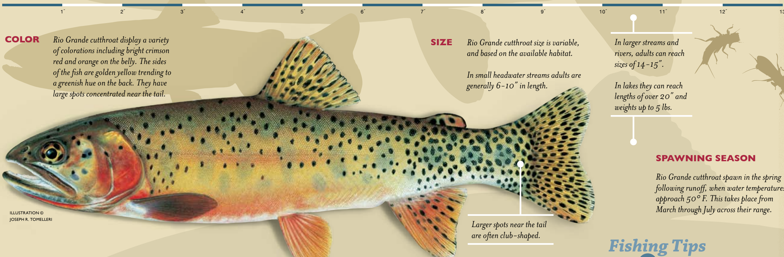
ILLUSTRATION © JOSEPH R. TOMELLERI

Rio Grande cutthroat spawn in the spring following runoff, when water temperatures approach 50° F. This takes place from March through July across their range.