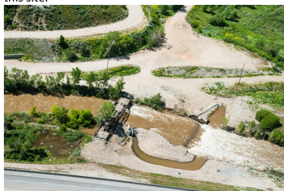
The lower Weber River Diversion after initial construction in 2011.

maintaining their failing infrastructure on the Weber River. By engaging the fish community, the water users were able to leverage their resources to reconstruct their diversion. Likewise, the fisheries interests were able to incorporate fish passage and screening elements into the project. Unfortunately the original project, as designed, had serious flaws, which limited fish passage only to moderate flows, and the screens experienced clogging. With the continuation of this partnership and funding from the Fish Habitat Partnerships and the UDWR, we were able to retrofit important high flow passage at this site