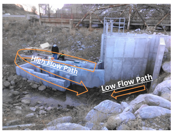
The high flow fish ladder immediately after construction. This projected added an additional pathway for fish to ascend this structure with the water coming together at the same point as the low flow passage structure for attraction.