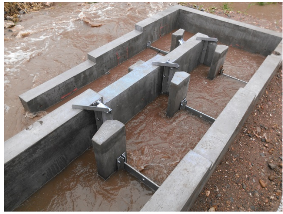
The high flow fish ladder in operation during May of 2015.