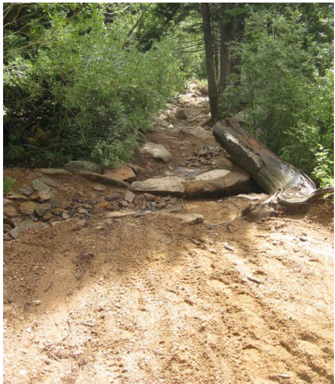
Img. 17 and 18: BEFORE and AFTER on large drain installation looking down-trail.