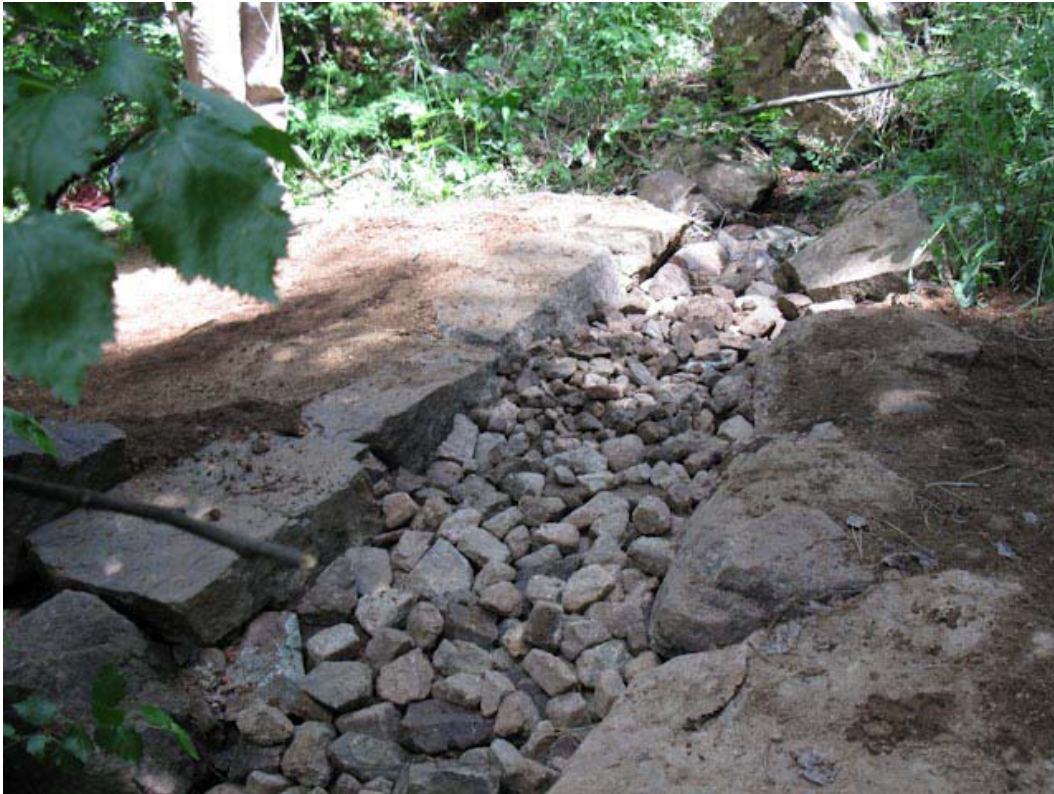
Img. 25: AFTER. Drain