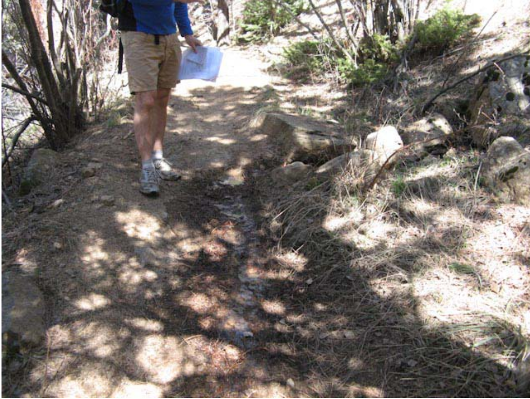
Img. 24: BEFORE. Water seep