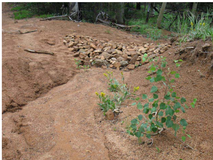
Img. 4: Rock check dam, catching sediment.