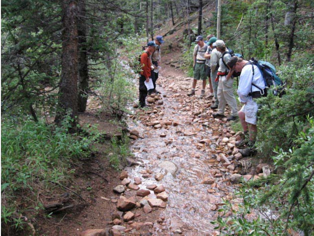
Img. 5: BEFORE water bar. Water is running down the trail.