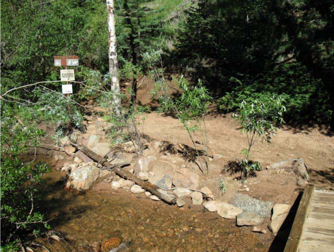
Img. 20: AFTER bank reconstruction.