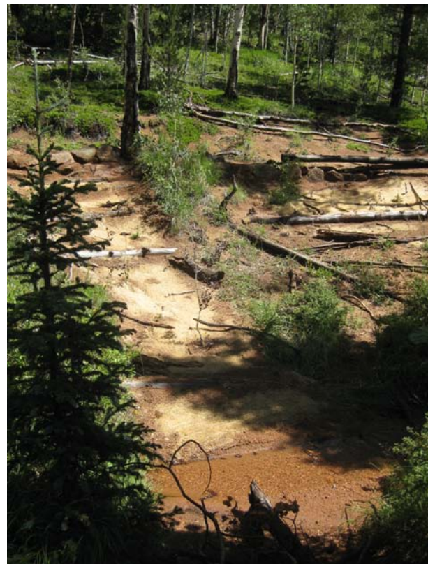
Img. 3: AFTER closure