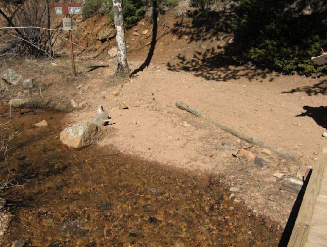
Img. 19: BEFORE bank reconstruction.