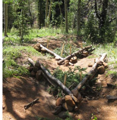
Img. 1: Brush check dams