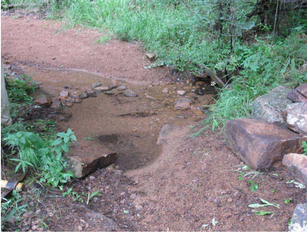
Img. 8: BEFORE drain. Water channel is unnecessarily wide.