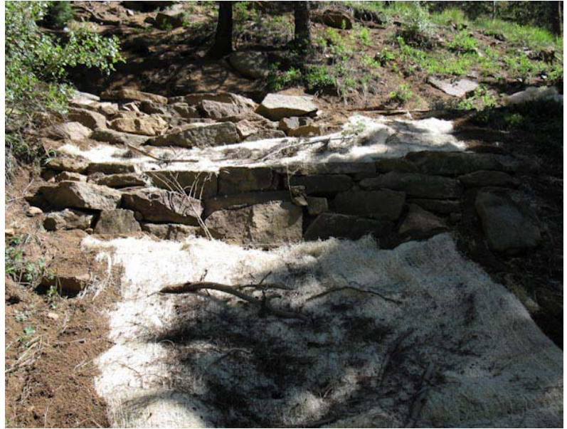
Img. 23: Below: AFTER. Rock retaining wall and restoration.