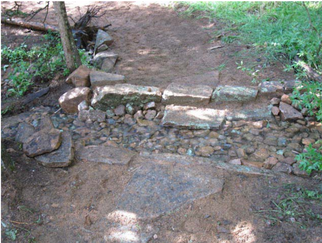
Img. 9: AFTER drain. Stream channel is constricted, water is kept free of sediment with cobbles.