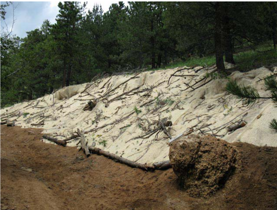
Img. 14: AFTER