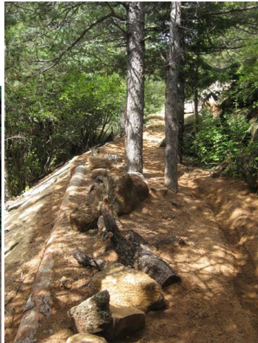
Img. 15: BEFORE. Trail is unnecessarily wide and outslope is unstable.