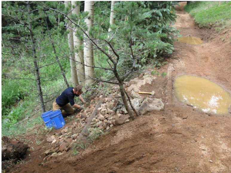
Img. 7: Outslope stabilization with timber logs and rock retaining wall.