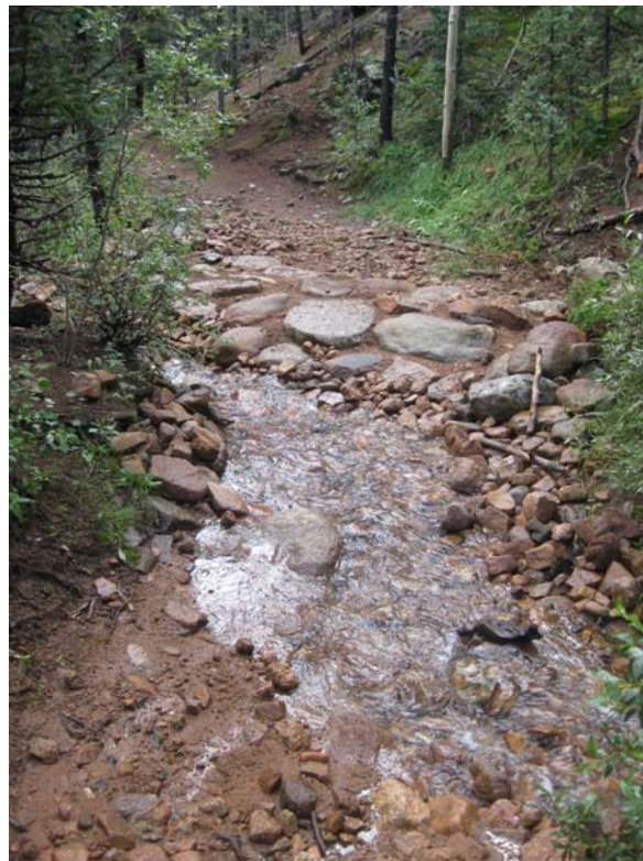
Img. 6: AFTER water bar and before new bridge.