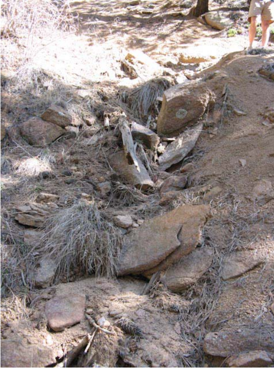
Img. 21: Left: BEFORE rock retaining wall construction. Slope is very unstable.