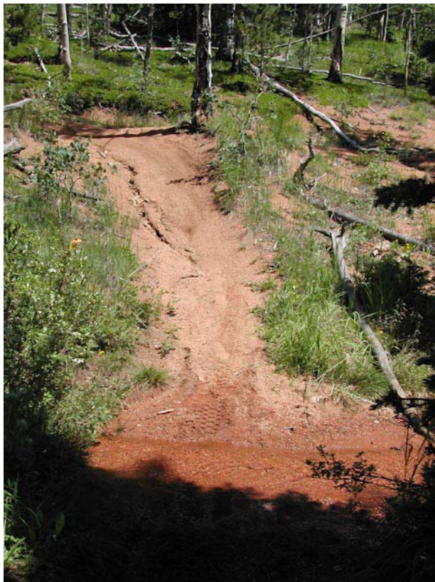
Img. 2: BEFORE closure of west end of old trail.