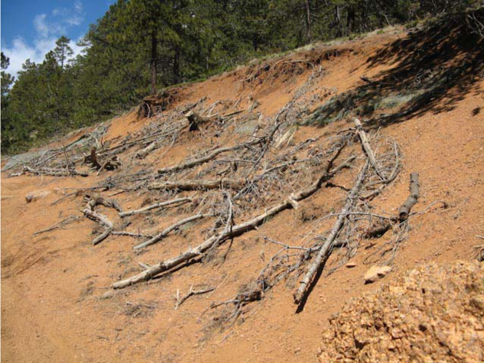
Img. 13: BEFORE