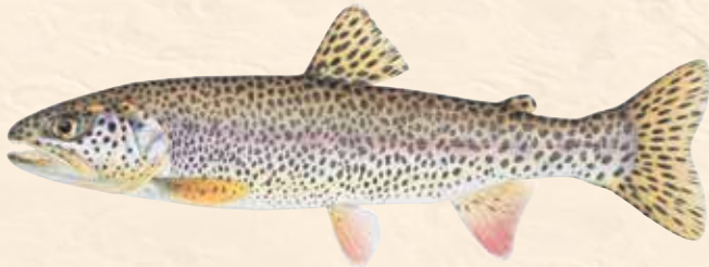
Coastal Cutthroat Trout

In order to ensure our collaborative investments are directed toward the highest priority projects, WNTI has funded over 671 watershed, fish population, and habitat surveys to date.